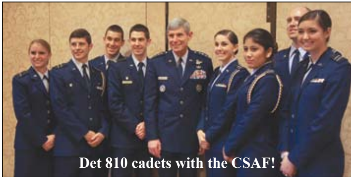
Det 810 cadets with the CSAF!

AFA Military Ball and Symposium: In April, several cadets traveled to Dallas for the AFA, Seidel Chapter's military ball & symposium. While there, they got to meet the Air Force Chief of Staff, Gen Norton A. Schwartz. What a night!