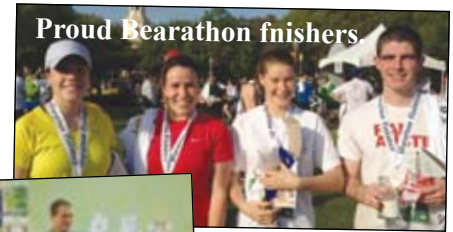
Proud Bearathon finishers

Community Involvement: The wing continues to be very active in the local community. This year they ran an aid station at the Bearathon, and