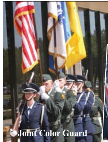
Joint Color Guard

Cadets also teamed up with Army ROTC to provide a joint Color Guard at a football game, and for the 9/11 Remembrance Ceremony, and to conduct a 24-hr flag Veterans' Day flag vigil.