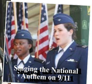
Singing the National Anthem on 9/11