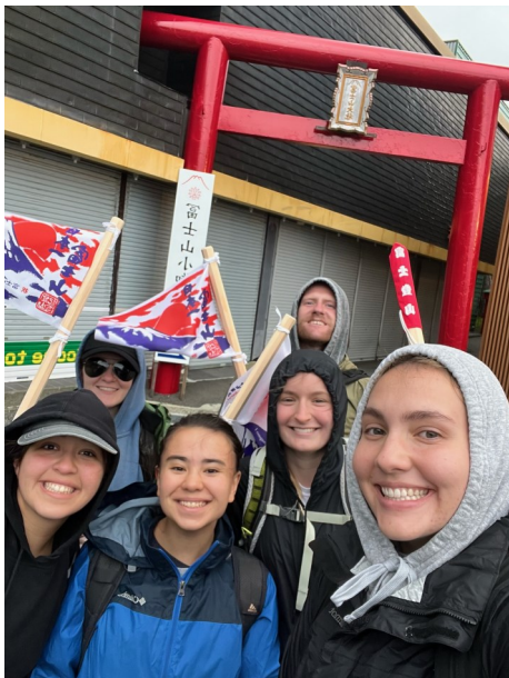
C/Zenero (blue coat) in Japan