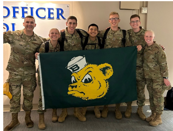
MAX 5 Graduates!