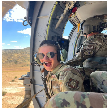
C/Majcher at Vertical Vanguard