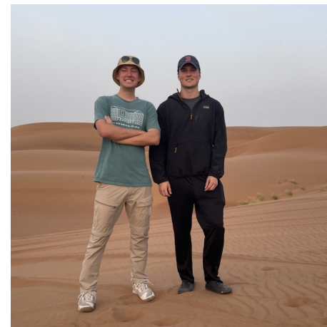
C/Greener & Waldo in Oman