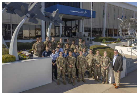
Det 810 Leading 4 Det F-35 Visit