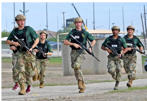
Det 810 Cadets at SW Prep Course