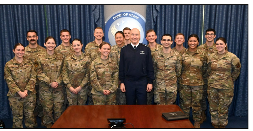
C/Sargent meeting CSAF (back row, 2nd from rt)