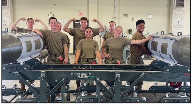
C/Zenero (ctr) building bombs