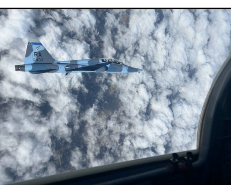
C/Brown slipping the surly bonds